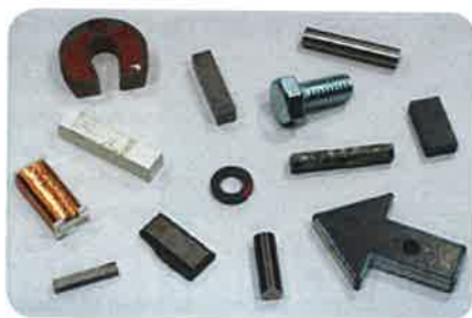
DO NOT USE!