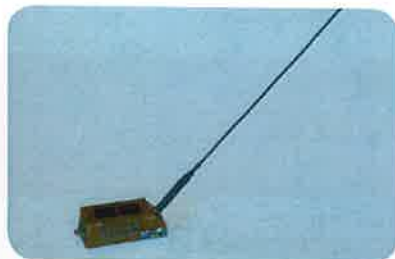
9.5 gram Solar PTT

We are happy to provide you with our state-of-the-art Solar PTTs.