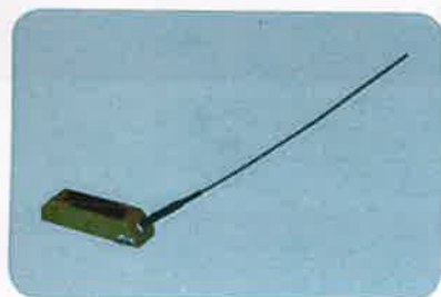
18 gram Solar PTT