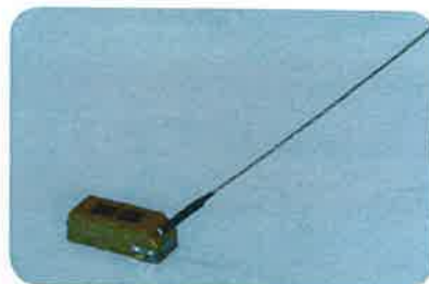
12 gram Solar PTT