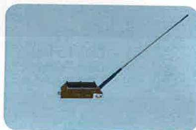
35 gram Solar PTT